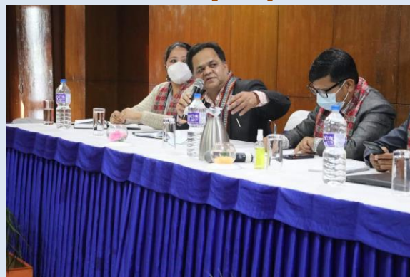
Women and Children, Ministry of Women Children and Senior Citizens.

free education (dress, lunch, books and stationeries) to reduce the risk of involvement in child labor.